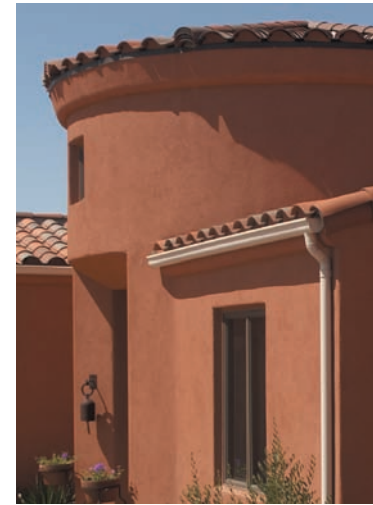
Durable and attractive, Allegro is cost-effective and easy to apply over stucco cladding.

Stucco is not very paint-friendly, either. If the PH of the stucco is too high when the paint is applied, or if the stucco is not fully cured over time, stucco may erode the bonds that hold the paint to it, and alkaline salts that accumulate on its surface reduce the area for paint to adhere to it in the first place.